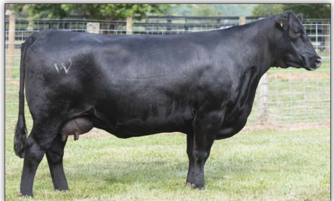
WHITESTONE BLACKCAP P166 - Stems from the same family as Lot 13.