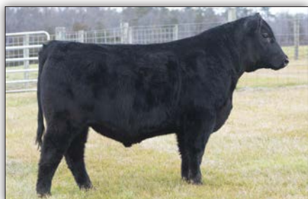
Whitestone Blue 3021 - He sells as Lot 2