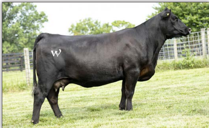
ZWT DONNA 9010 - Granddam of Lot 36.