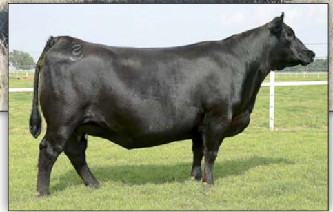
SITZ HENRIETTA PRIDE 643T - The $390,000 third dam of Lot 22.