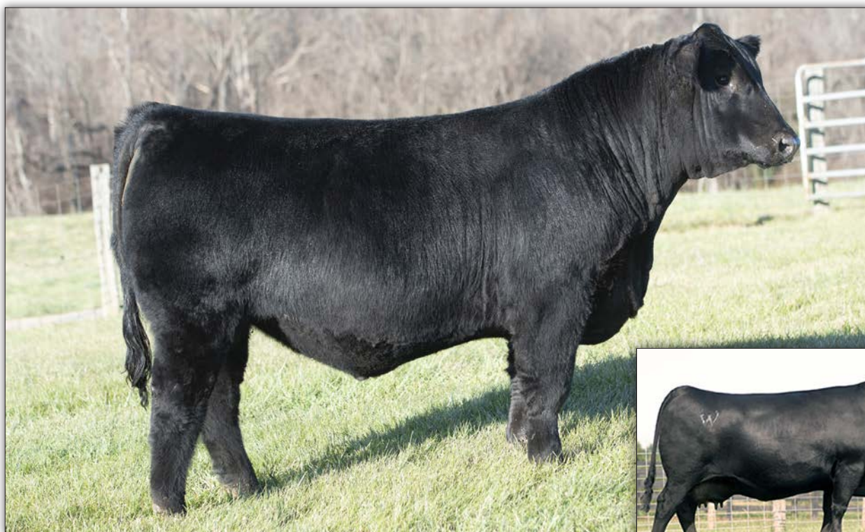
WHITESTONE SALTY DOG 3003 - He sells as Lot 34.