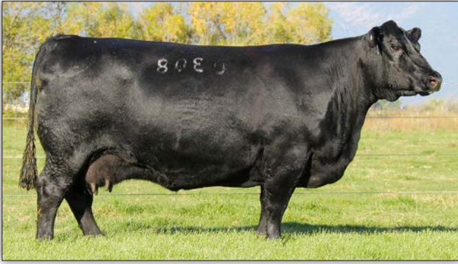
COLEMAN DONNA 0308 - Pathfinder full sister to the third dam of Lot 24.