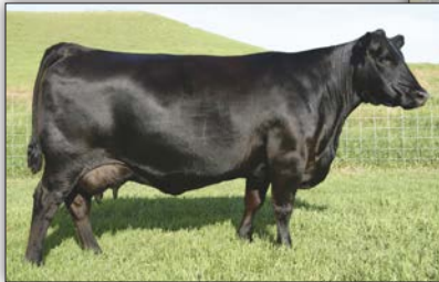
BR POLLY 8077-472 - Granddam of Lots 5 and 6.