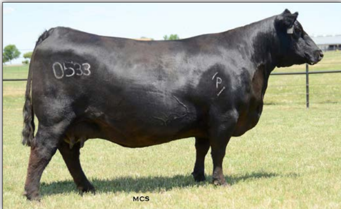
PF 5682 HENRIETTA PRIDE 0533 - Granddam of Lot 9.