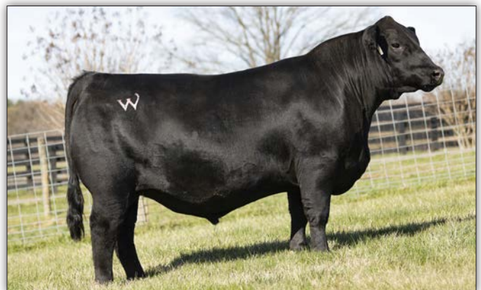
WHITESTONE BUCKAROO 2021 - The $6,500 maternal brother to Lots 2-4.