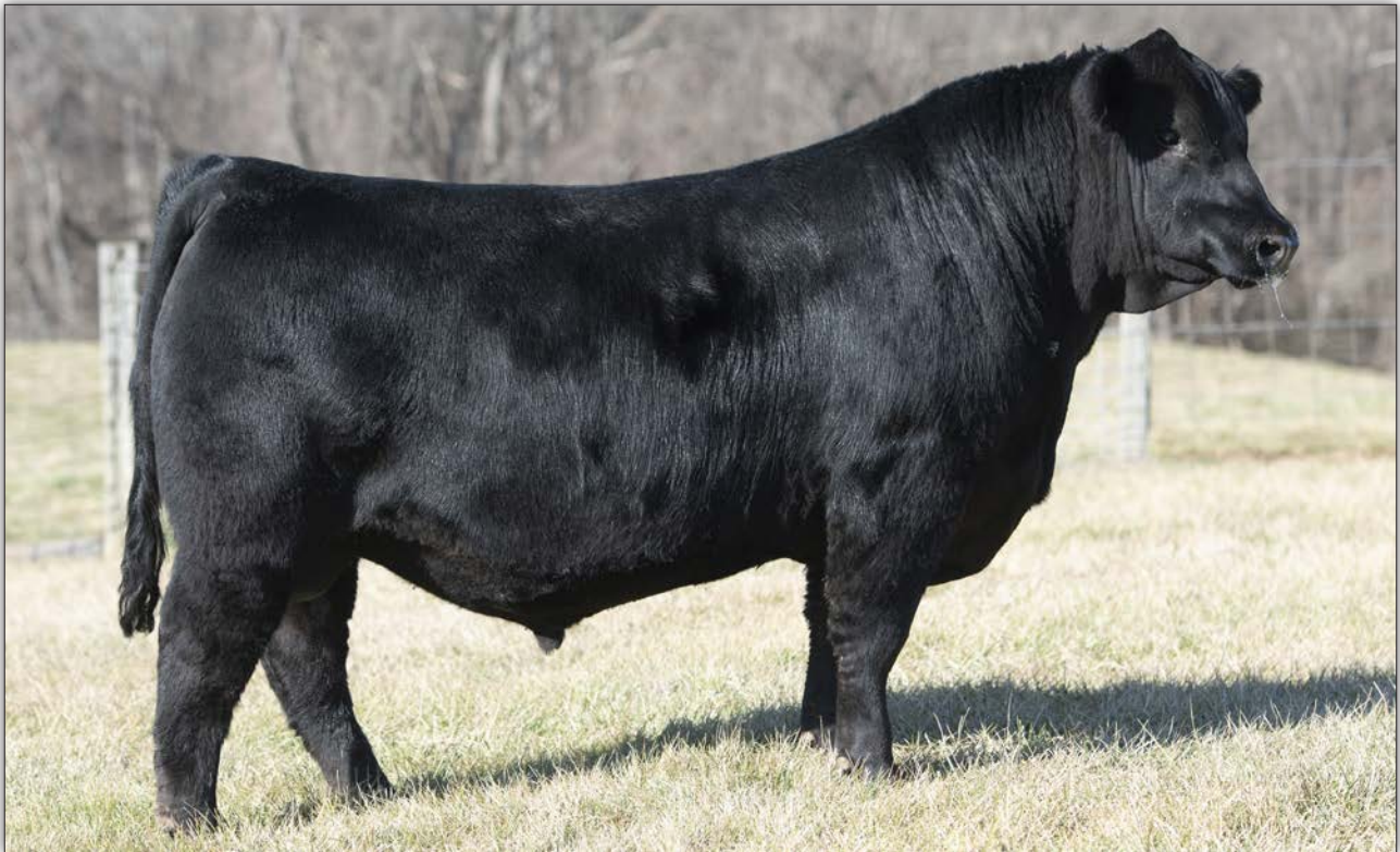
WHITESTONE TANGO 3116 - He sells as Lot 62.