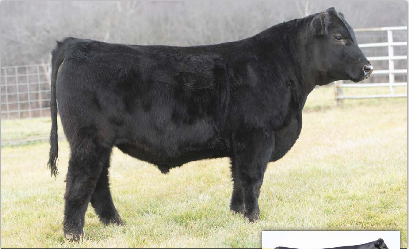
Whitestone Ammo 3030 - He sells as Lot 7