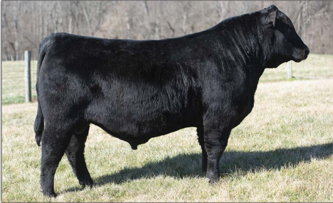
Whitestone Tupelo 3062 - He sells as lot 11