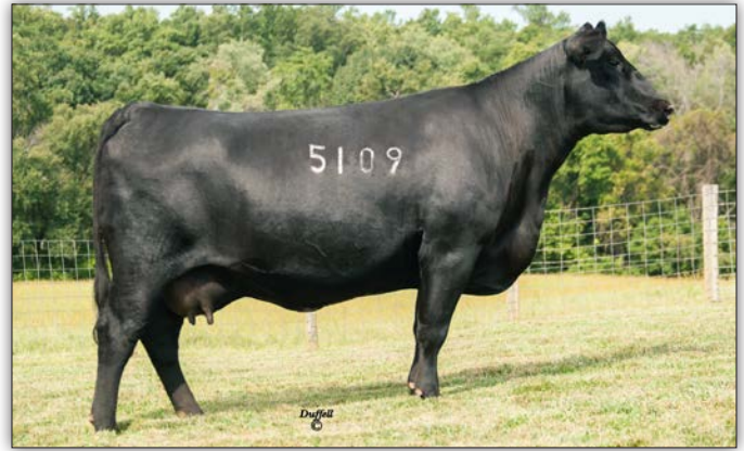
WHITESTONE EVERELDA 5109 - Granddam of Lot 119.