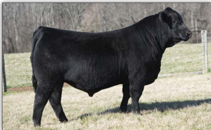
Whitestone Blue Ridge 3139 - He sells as Lot 1