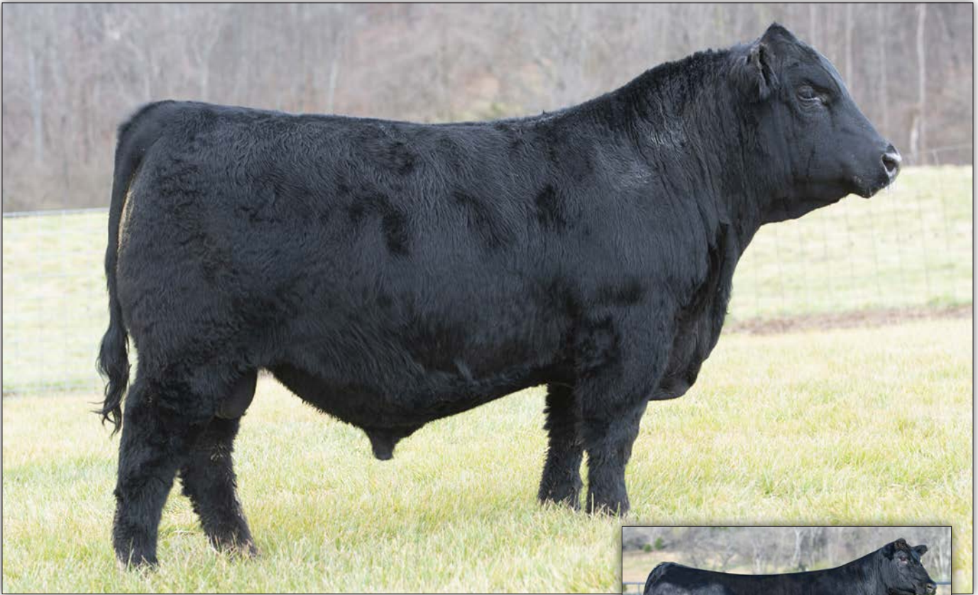
WHITESTONE PROFIT 3054 - He sells as Lot 37.