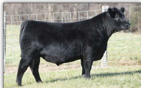
Whitestone Martin 3041 - He sells as Lot 6