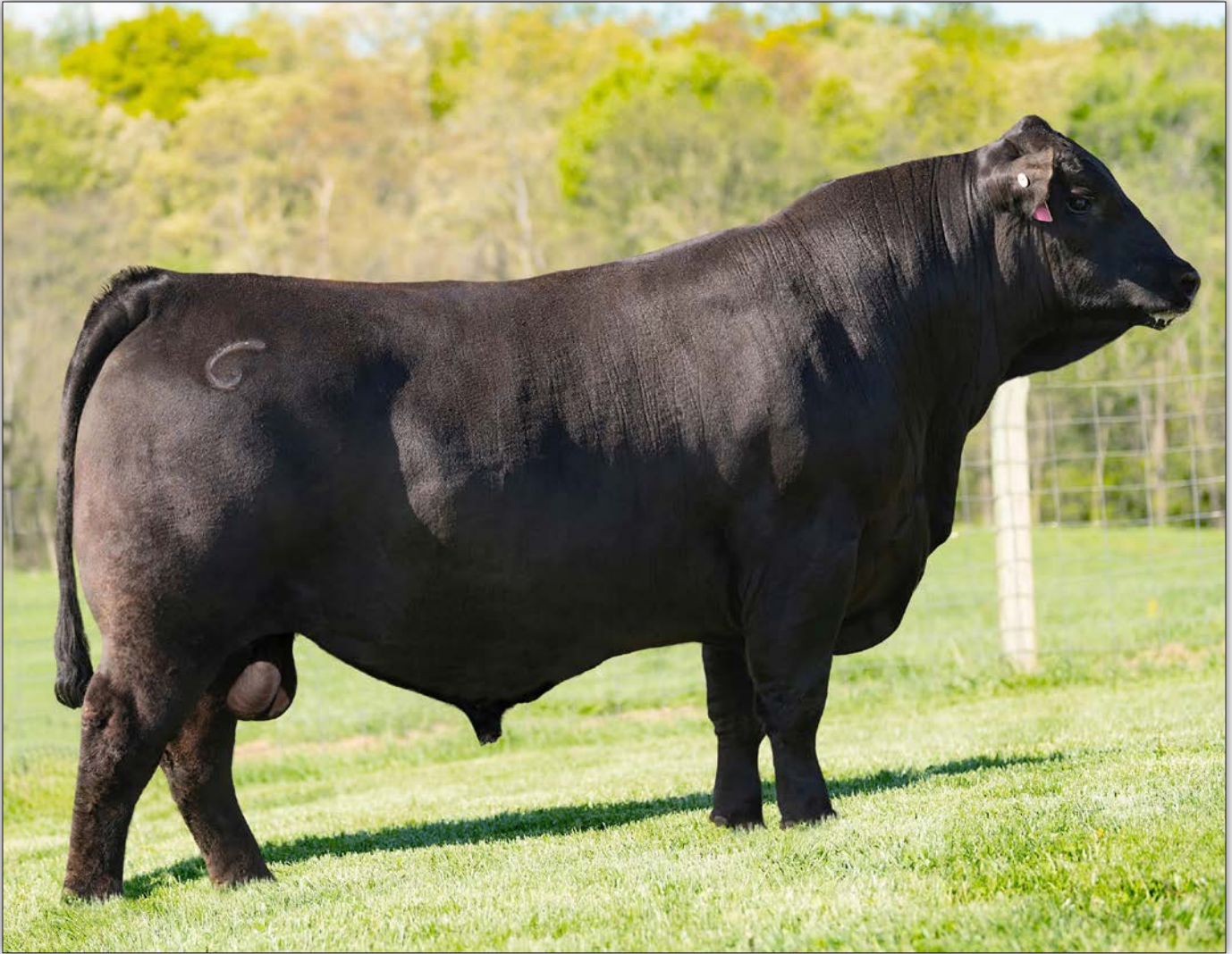
CONNELY SCOTCHMAN - Reference Sire I.