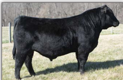
Whitestone Tupelo 3062 - He sells as Lot 11