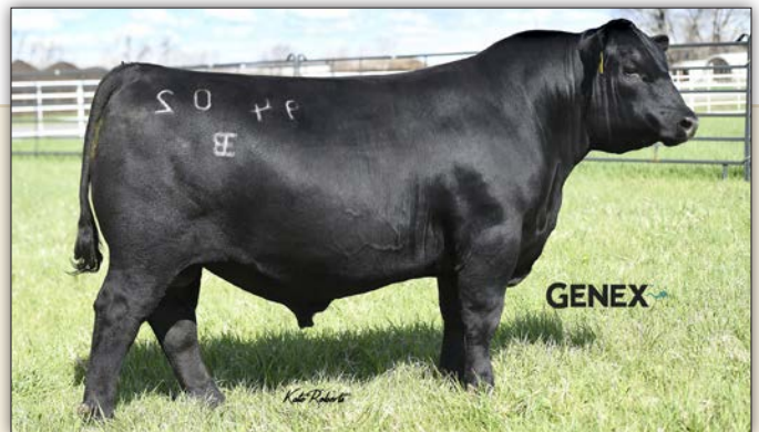
E & B WILDCAT 9402 - Reference Sire G.