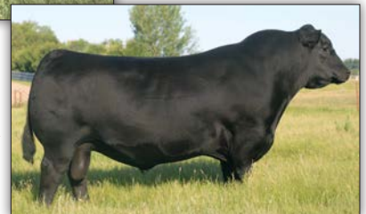
S A V SUPERCHARGER 6813 - Maternal brother to the granddam of Lot 7.