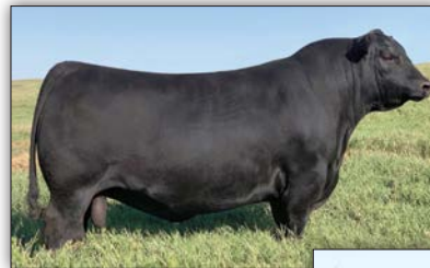
S A V AMERICA 8018 - Record-selling bull and maternal brother to the granddam of Lot 7.