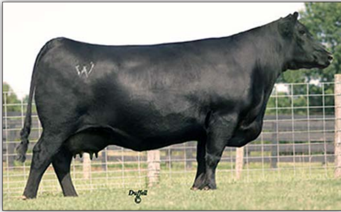
WHITESTONE EVERGREEN W243 - Granddam of Lot 87.