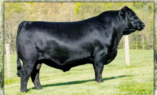
WHITESTONE - The $70,000 maternal brother to the dam of Lot 54.