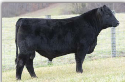
Whitestone Bandit 3035 - He sells as Lot 5