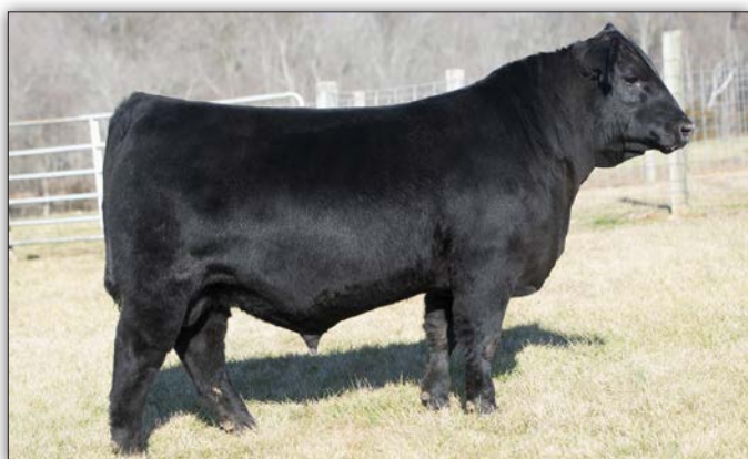
WHITESTONE RAPPAHANNOCK 3122 - He sells as Lot 14