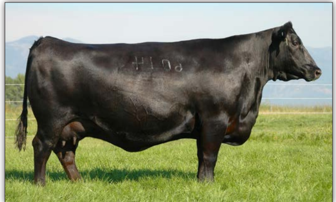
BOHI ABIGALE 6014 - Granddam of Lot 107.

★ She had an individual birth ratio of 94, %IMF of 108, progeny production record of BR 1@84, UREA 1@105 and stems from a dam that records BR 2@91, %IMF 1@108. ★ Sells with a bull calf at side (Lot 108A) born February 14, 2024 by CONNEALY CRAFTSMAN. Tatoo: 4176.