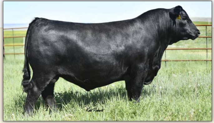
LAR MAN IN BLACK - Reference Sire F.