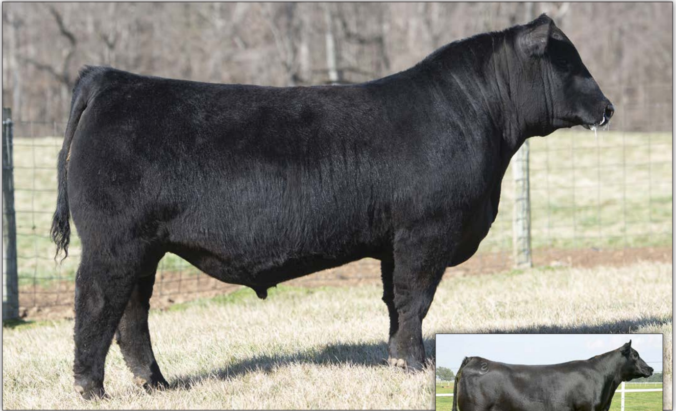
WHITESTONE JASPER 3157 - He sells as Lot 22.