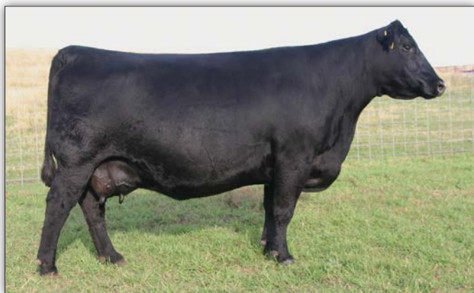
S A V MADAME PRIDE 0075 - Granddam of Lot 123.