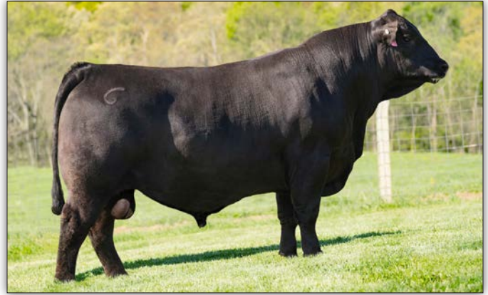
CONNEALY SCOTCHMAN - His offspring sell.

★ She had an individual %IMF of 110, UREA of 101, progeny production record of BR 1@84, %IMF 1@113 and stems from a dam that records WR 4@104, %IMF 2@140, UREA 2@104 with two daughters in production with an average nursing ratio of 101. ★ Sells with a bull calf at side (Lot 105A) born February 29, 2024 by CONNEALY SCOTCHMAN. Tatoo: 4196. Reg. No. 20915783.