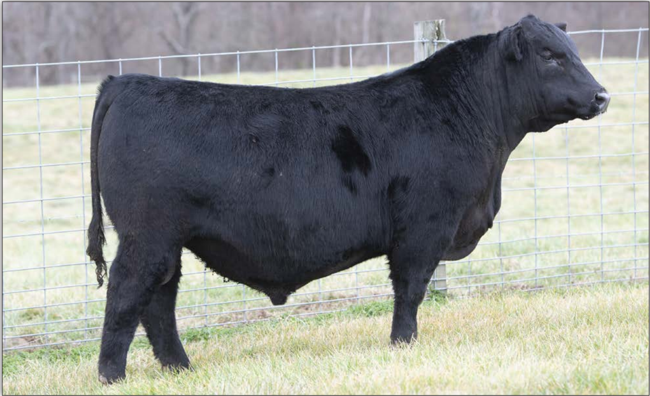
WHITESTONE BULLET 3077 - He sells as Lot 39.