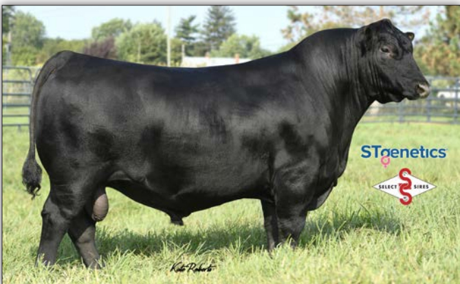
CONNEALY CRAFTSMAN - His offspring sell.