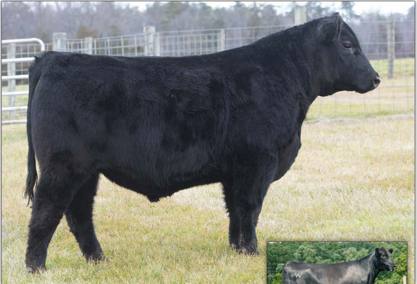
Whitestone Blue 3021 - He sells as Lot 2