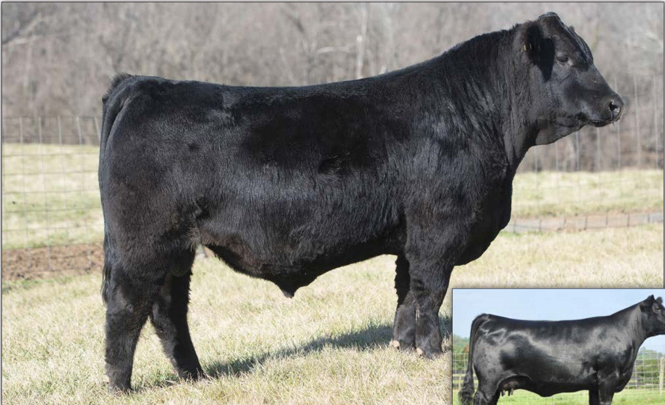
WHITESTONE PLATINUM 3031 - He sells as Lot 73.