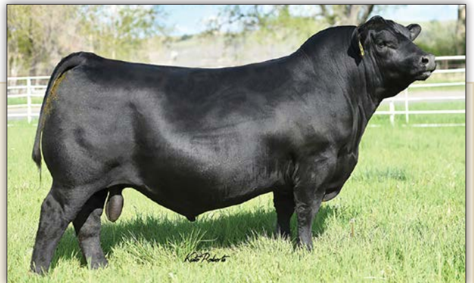
S ARCHITECT 9501 - Reference Sire C.