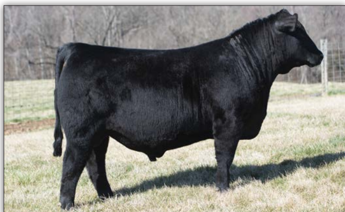
WHITESTONE BENNIE 3186 - He sells as Lot 20.