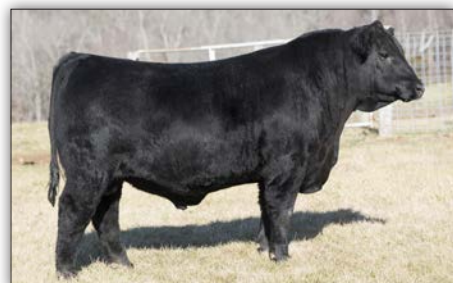
WHITESTONE AMOS 3083 - He sells as Lot 13