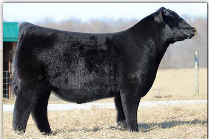
SCC SCH 24 KARAT 838 - Reference Sire H.