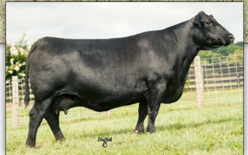
B&B ERICA 605 - Pathfinder granddam of Lot 53.