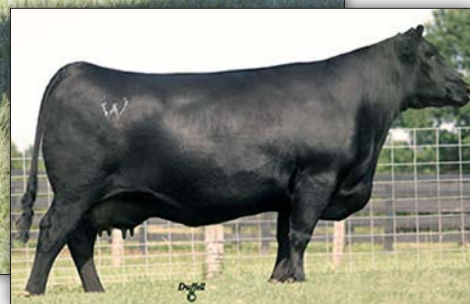
WHITESTONE EVERGREEN W243 - Granddam of Lots 34 and 35.