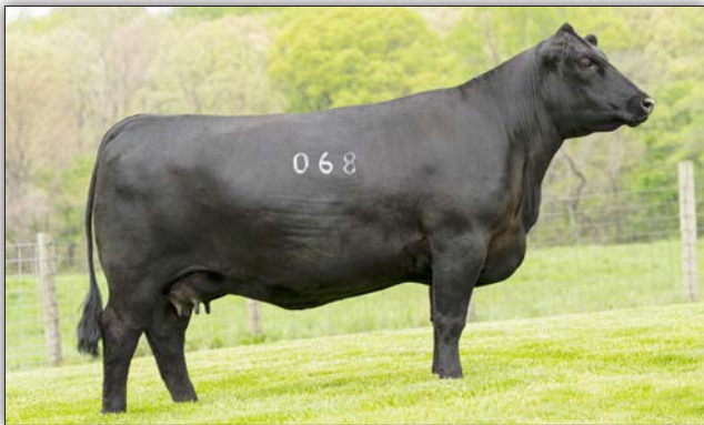
COLEMAN DONNA 068 - $17,000 Dam of Lot 25.