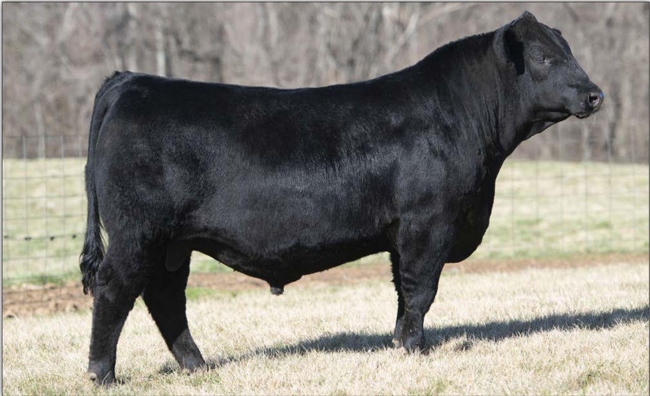
WHITESTONE BINGO 3085 - He sells as Lot 58.