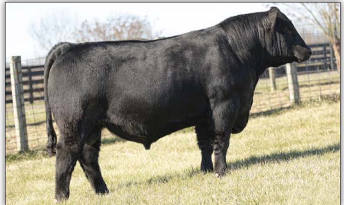
WHITESTONE SURPASS 2049 - The $11,000 maternal brother to Lot 8.