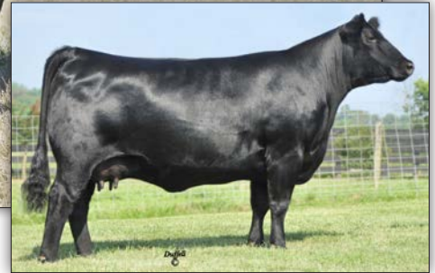
TRIARA ENAMEL 894U - Dam of Lot 73.