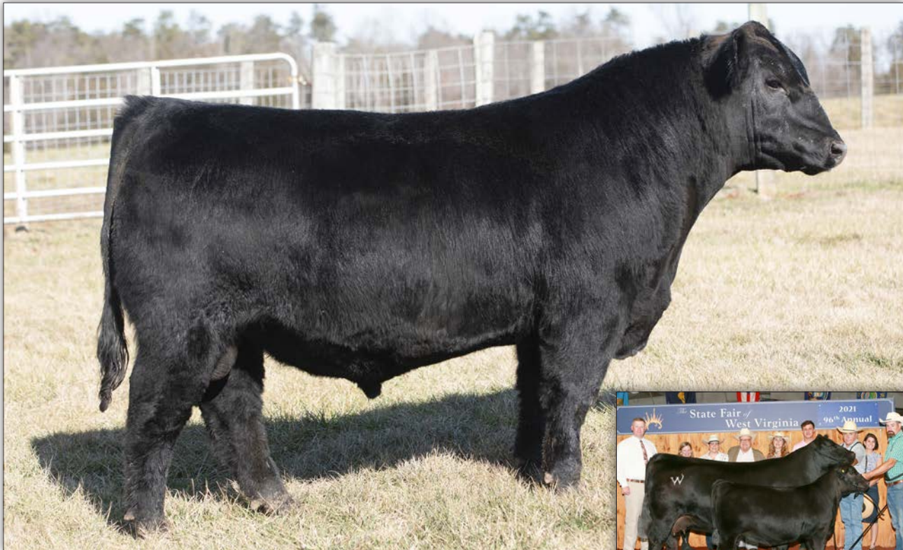
WHITESTONE STERLING 3011 - He sells as Lot 71.