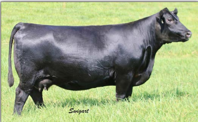
PVA BLACKCAP MAY 4397 - Dam of Lot 103.