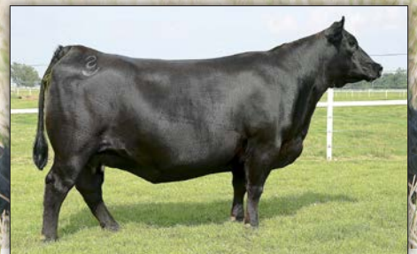
SITZ HENRIETTA PRIDE 643T - The $390,000 third dam of Lot 23.