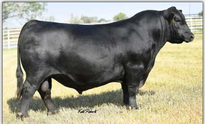
DB ICONIC G95 - Sire of Lots 37-52.