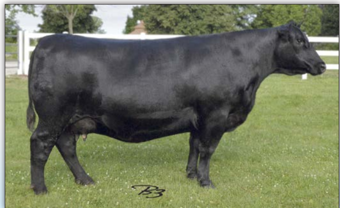
R B LADY STANDARD 305-0790 - Third dam of Lot 96.

★ She had an individual birth ratio of 89, weaning ratio of 101 and stems from a dam that records BR 2@86. ★ Sells with a heifer calf at side (Lot 96A) born March 2, 2024 by CONNEALY SCOTCHMAN. Tattoo: 4203. Reg. No. 20912768.