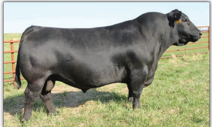
S A V RESOURCE 1441 - Full brother to the fourth dam of Lot 120.