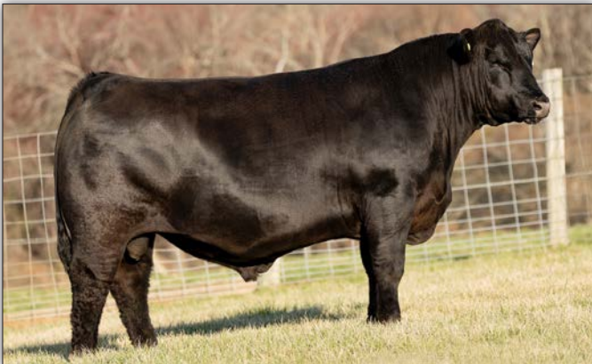
WHITESTONE STORM 2027 - The $7,000 maternal brother to Lot 8.

★ He had an individual UREA of 108 and stems from a dam that records BR 6@89, WR 6@103, YR 5@104, %IMF 12@108, UREA 12@108.