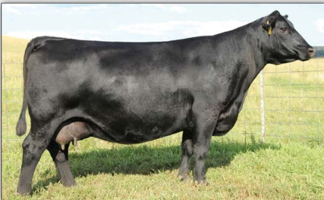
S A V EMBLYNETTE 7531 - Maternal sister to the third dam of Lot 39.