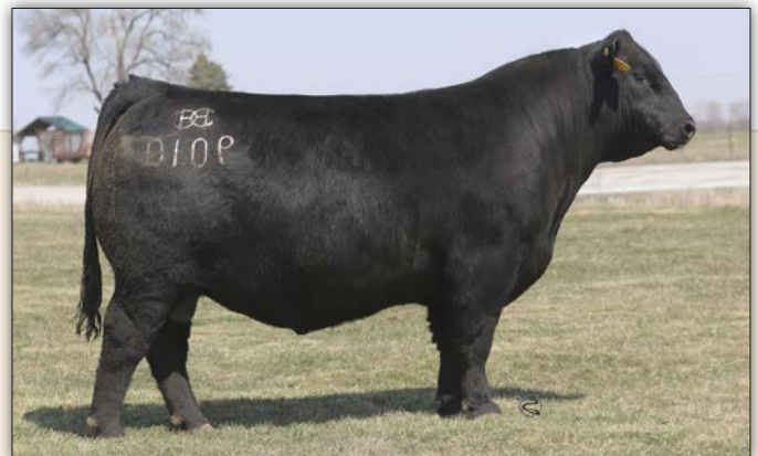
HCC WHITEWATER 9010 - Reference Sire B.