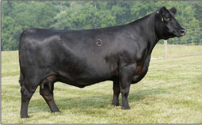
MONOMOY RITA G12 - Dam of Lot 99.