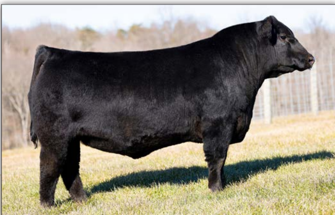
WHITESTONE YETI 0024 - The $10,500 maternal brother to Reference Sire A.