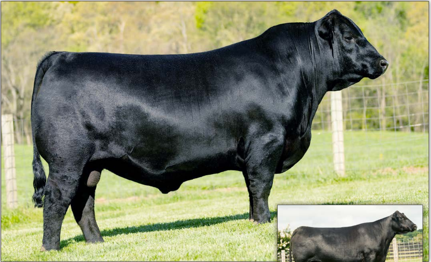
WHITESTONE - Reference Sire A.