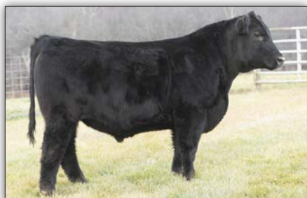
Whitestone Ammo 3030 - He sells as Lot 7