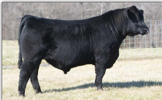
Whitestone Regulator 3039 - He sells as Lot 8