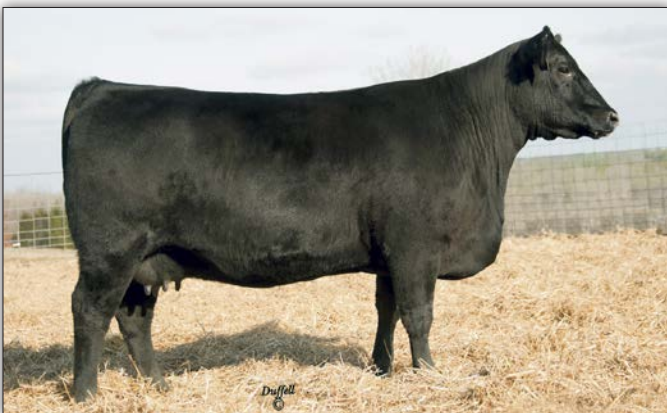
S A V POLLY 9829 - Third dam of Lot 12.