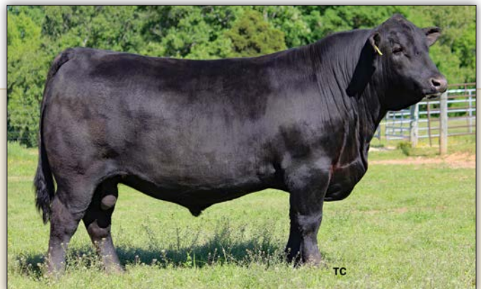
BJ SURPASS - Reference Sire E.