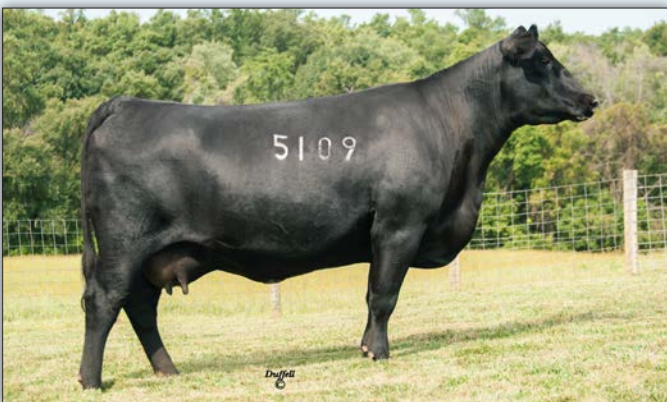
WHITESTONE EVERELDA 5109 - The $90,000 valued granddam of Lot 76.

77 Windy Cove Primrose 223 BD: 04-02-2023 Cow 20714491 TATTOO: 223