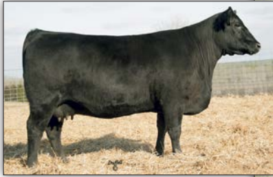
S A V POLLY 9829 - Dam of Lots 5 and 6.