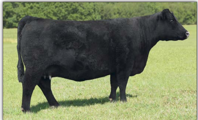
2K BEAUTY 961 - Granddam of Lot 43.