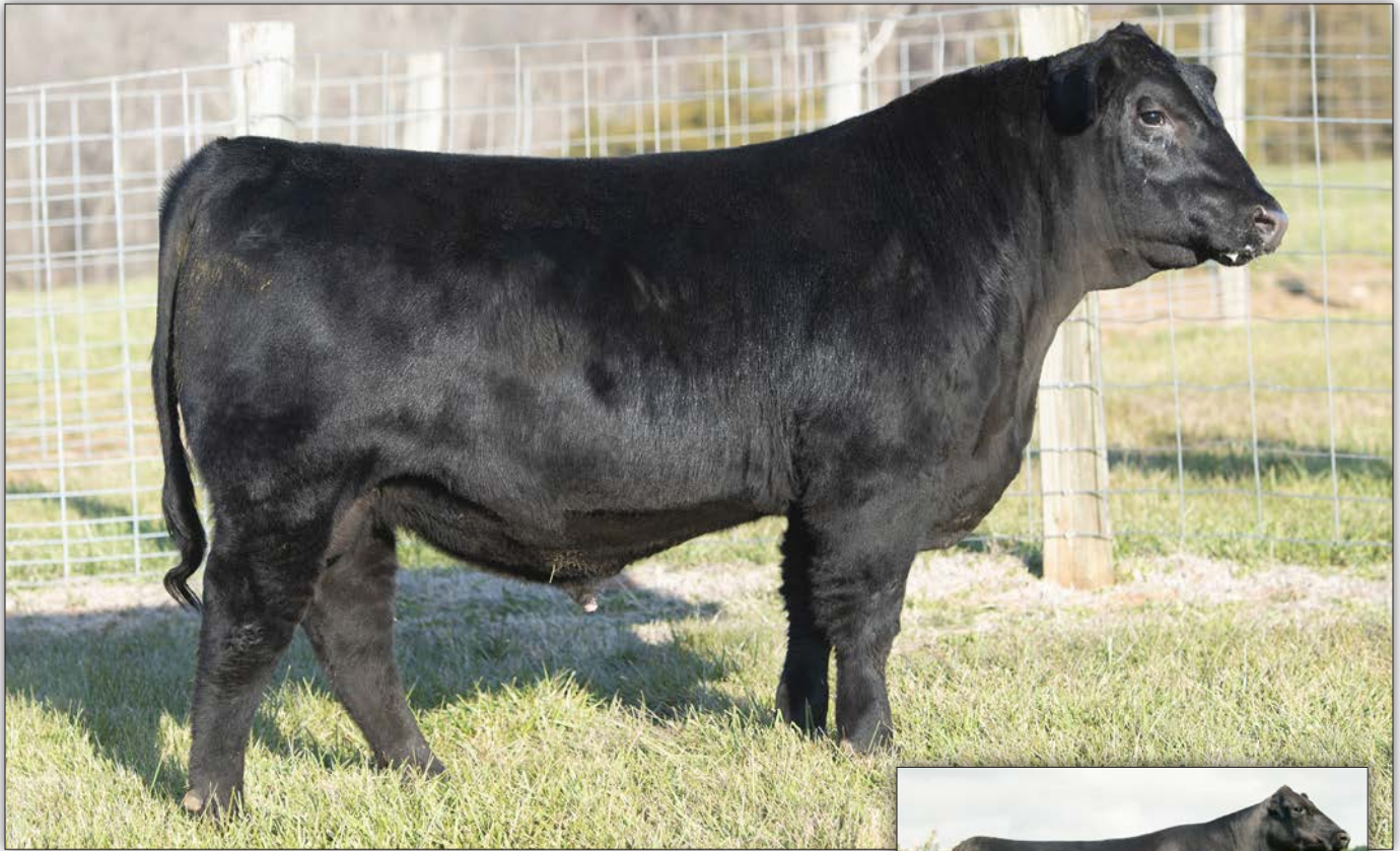
WHITESTONE BARRIER 3004 - He sells as Lot 53.