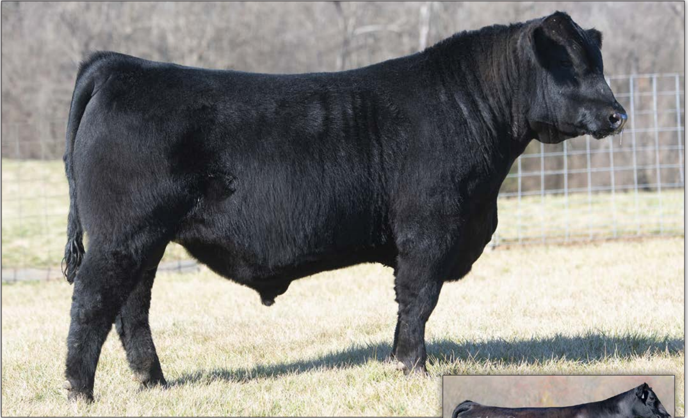
Whitestone Regulator 3039 - He sells as Lot 8