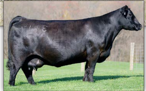
S S MISS DAYBREAK K011 3K17 - Pathfinder dam of Lot 8.