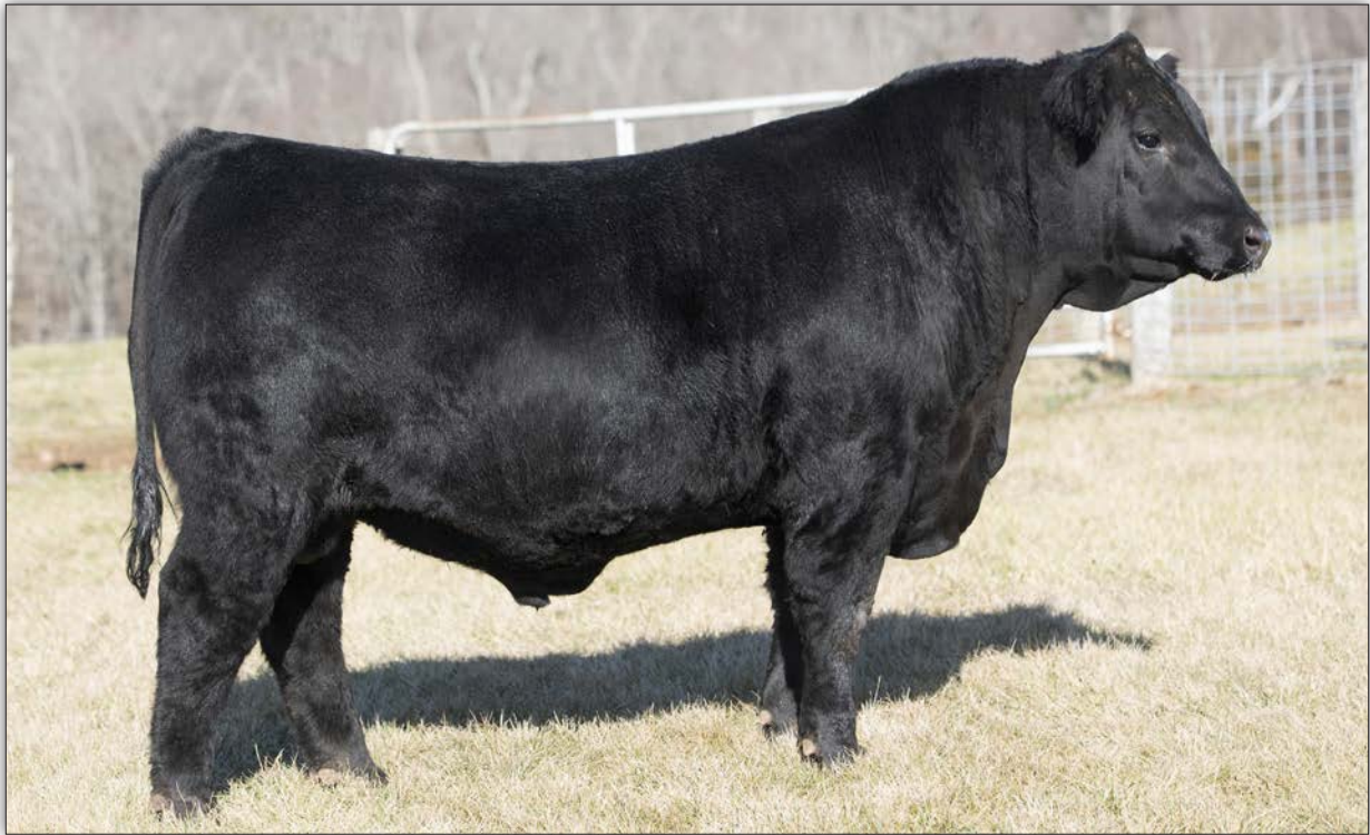
WHITESTONE AMOS 3083 - He sells as Lot 13.