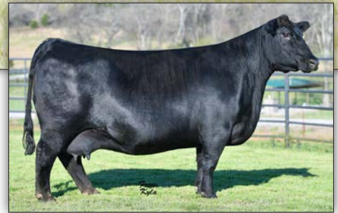
S A V EMBLYNETTE 0491 - Third dam of Lot 37.