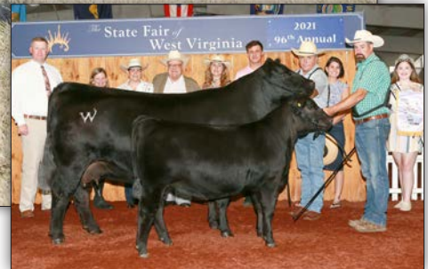
WHITESTONE EMBLYNETTE 730 - Dam of Lots 71 and 72.