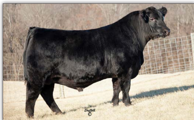
WHITESTONE 18-MILLION - Maternal brother to the granddam of Lot 84.

BD: 01-04-2023 Cow *20621932 TATTOO: 3076 #*Mill Brae Identified 4031 #*Koupals B&B Identity #*HCC Whitewater 9010 *Mill Brae Pro Blackcap 1092 19870506 *Rock Creek Sara 6066 *Silveiras Conversion 8064 #*S S Enforcer E812 #*H P C A Confidence A322 #Whitestone Everelda 1115 #SydGen Enhance 20034993 +*Whitestone Everelda 9049 #S S Miss Daybreak K011 3K17 *Byergo Black Magic 3348 Whitestone Everelda 5109