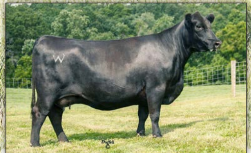
WHITESTONE EVERGREEN 5029 - Dam of Lot 33.