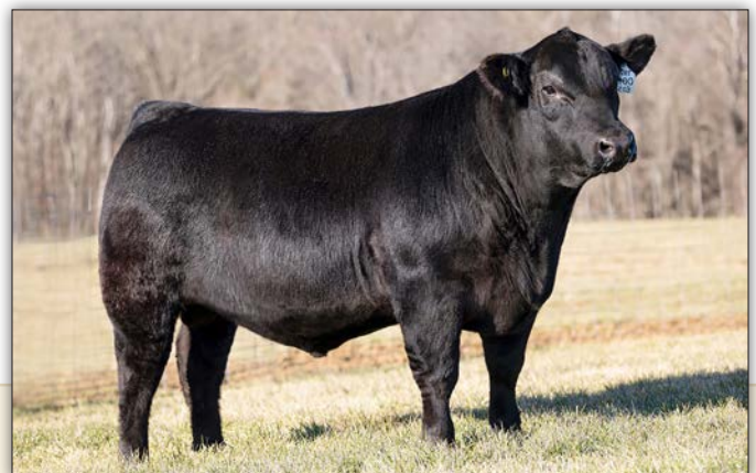
WHITESTONE JACKPOT 0011 - The $11,500 maternal brother to Reference Sire A.