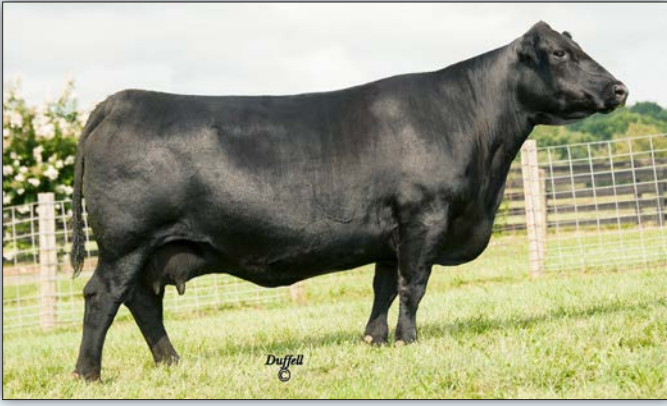
B&B ERICA 605 - Pathfinder granddam of Lot 75.

75 Blessed B Erica 083 [AMF-CAF-DOF-DOF-MIF-NHF-CHF-OSF-RDF] BD: 02-08-2023 Cow *20584190 TATTOO: 083