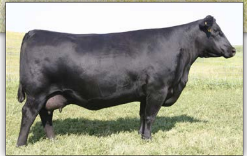
S A V MADAME PRIDE 5290 - Granddam of Lot 7.