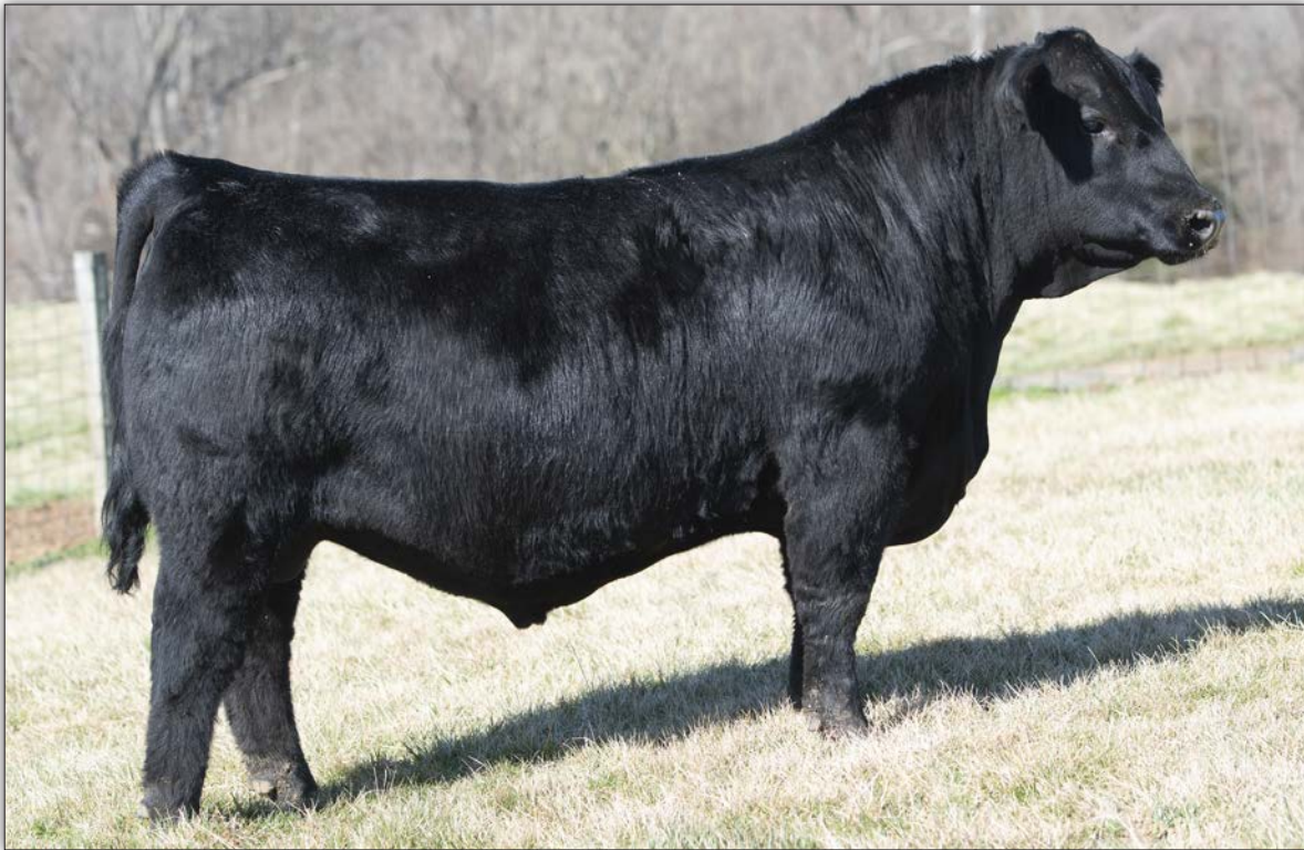
WHITESTONE PREMIER 3187 - He sells as Lot 66.