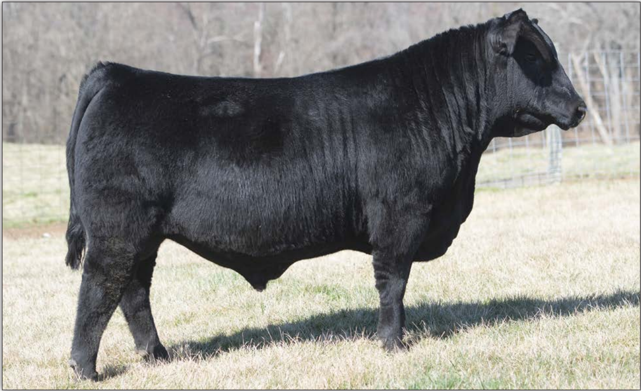
WHITESTONE IDEAL 3069 - He sells as Lot 44.