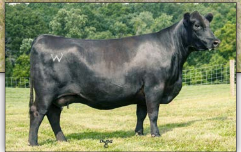
WHITESTONE EVERGREEN 5029 - Dam of Lots 2-4.