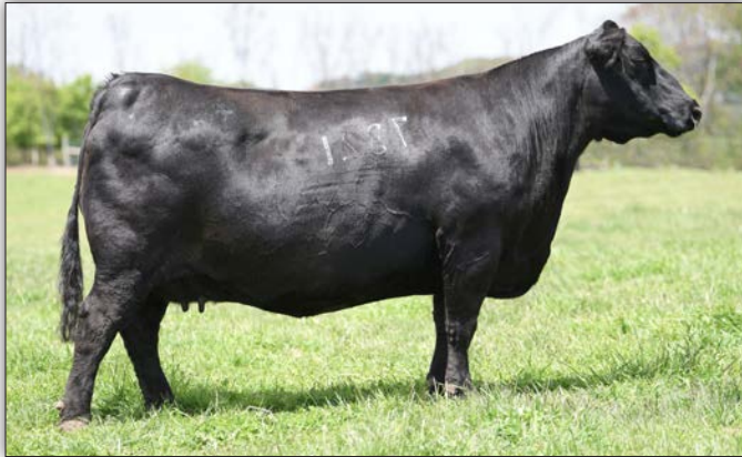
SH LADY 7321 939 - Third dam of Lot 30.