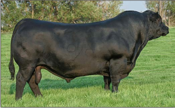
COLEMAN ROCK 7200 - A full brother to the granddam of Lot 114.