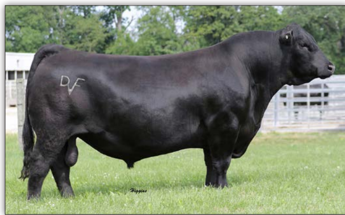
DEER VALLEY GROWTH FUND - His daughters sell.

BD: 04-17-2023 Cow 20714495 TATTOO: 723 #*Basin Payweight 1682 21AR O Lass 7017 #*Deer Valley Growth Fund 21AR O Lass 7017 18827828 +*Deer Valley Rita 36113 #*Plattemere Weigh Up K360 +*Deer Valley Rita 9457 #*S A V President 6847 #*Coleman Charlo 0256 #*S A V Blackcap May 4136 LPH Pride 437 062 #*Connealy Confidence 0100 20060575 LPH Pride 437 Pine Hill Pride 259